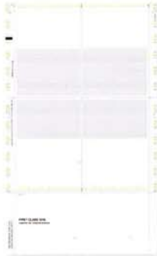
W-2 4up Version 1 80640—Comparable to MWI289