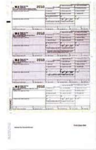
W-2 4up Version 2 80483—Comparable to MWI286