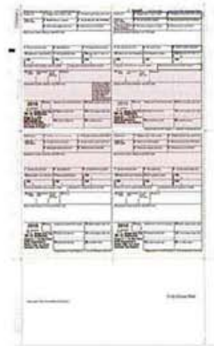
W-2 4up Version 1 80481—Comparable to MWI287