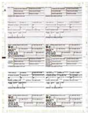
W-2 4up 80732—Comparable to MW285