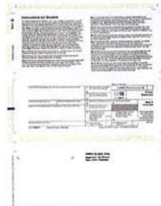
1098-T 80736—Comparable to MW359