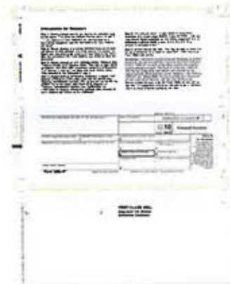
1099-INT 80485—Comparable to MW351