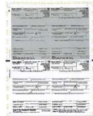
1099-R 4up 80735—Comparable to MW284