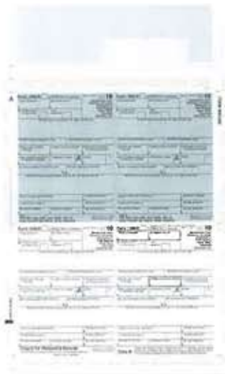
1099-R 4up 80799—Comparable to MW1240