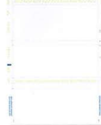
1099 Multi-Purpose 80349—Best used for 1099-INT & 1099-DIV