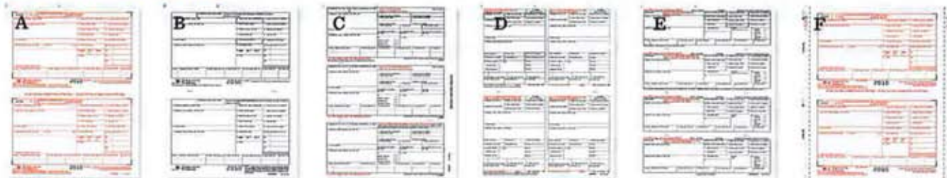
A Traditional, two employees per page