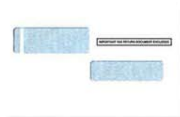
W-2c Double Window Envelope W2CENV05

You need one W-3 form to summarize all paper W-2 Copy A forms for a single company (EIN). Do not use W-3 forms when e-filing. If you need more than the THREE FREE copies we send with your W-2s, order #BW305.