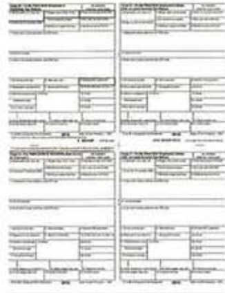
W-2 Employee 4up Ver IA Copies C/B/2/2 W24UPA