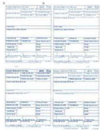
W-2 Employer 4up Copies I/D BW24UPER05

You need one W-3 form to summarize all paper W-2 Copy A forms for a single company (EIN). Do not use W-3 forms when e-filing. If you need more than the THREE FREE copies we send with your W-2s, order #BW305.