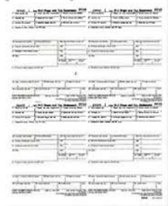
W-2 Employer 4up Ver IA Copies I/D 80026