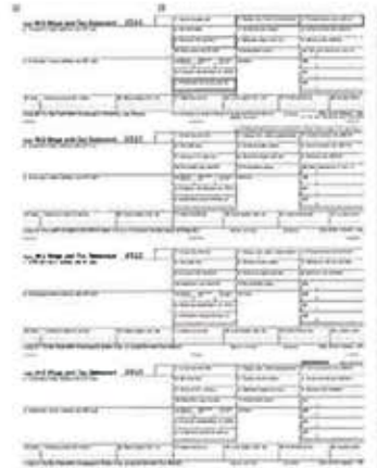
W-2 Employee 4up Ver 2A Copies B/C/2/2 BW24DUNA