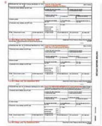
W-2 Employee 3up Copies B/2/C BW23UP05