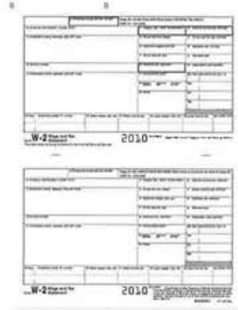
W-2 Employee 2up Copies B/C BW2EEBC05

Formats may change in compliance with IRS standards.