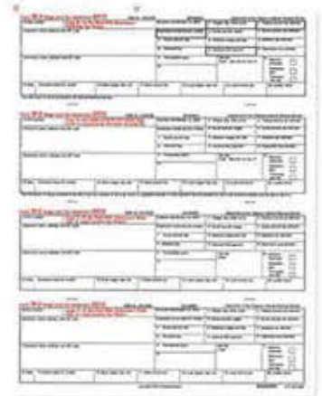
W-2 Employee 4up Ver 2 Copies B/C/2/2 BW24DWN05