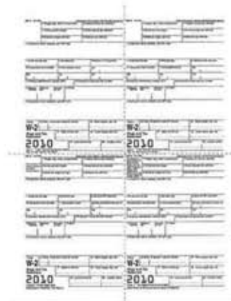
W-2 Employee 4up Copies 2/2/B/C 80071