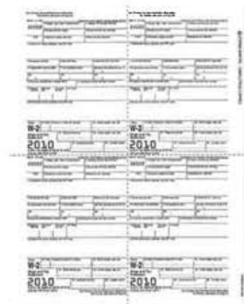
W-2 Employer 4up Copies I/D 80072