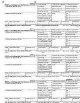
W-2 Employer 4up Ver 2A Copies I/D B40WNEMP