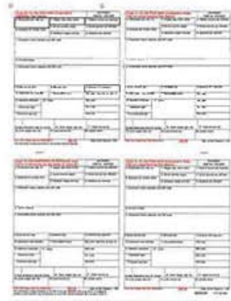
W-2 Employee 4up Ver 1 Copies B/2/C/2 BW24UP05